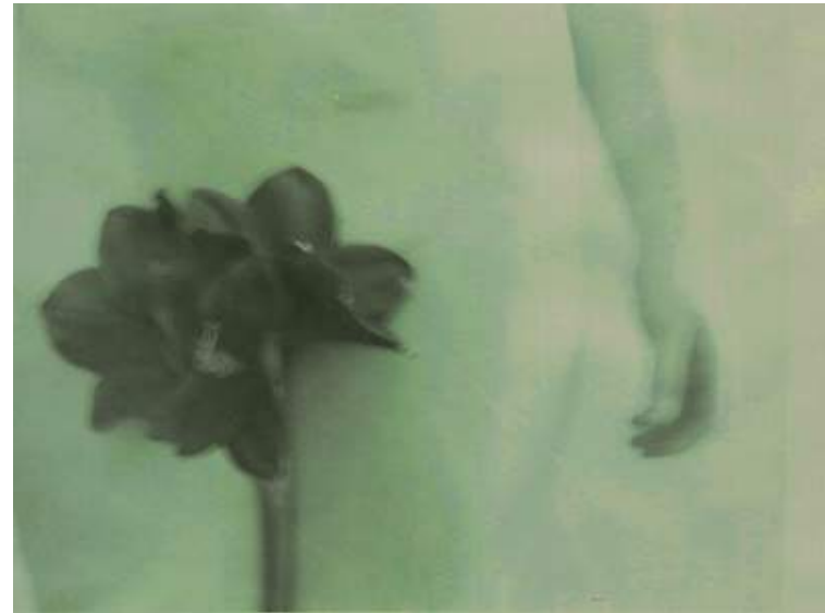
La Divergence eins und zwei, Vienna 2005