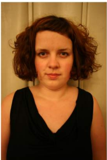
me as neutral