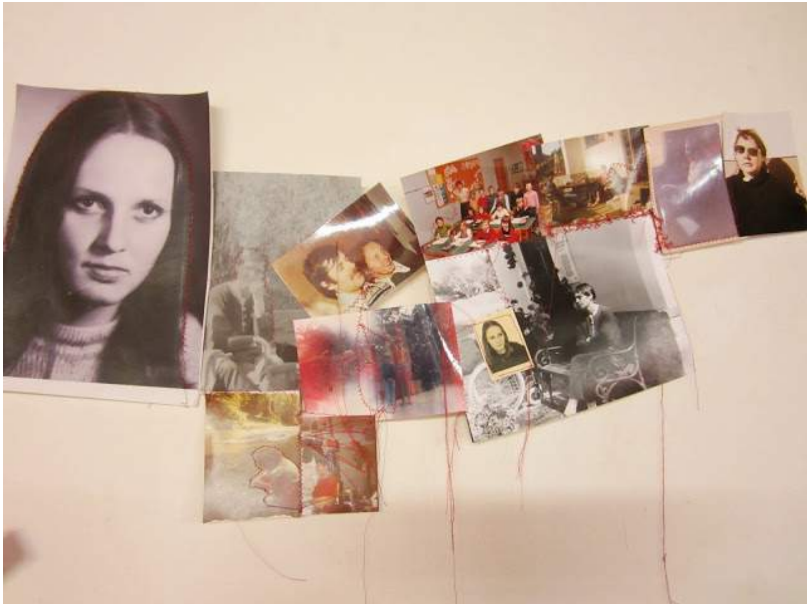
31/60 oder der rote Faden, Wien 2013

Trying to patch combine individual parts into a whole, the thread tracing.