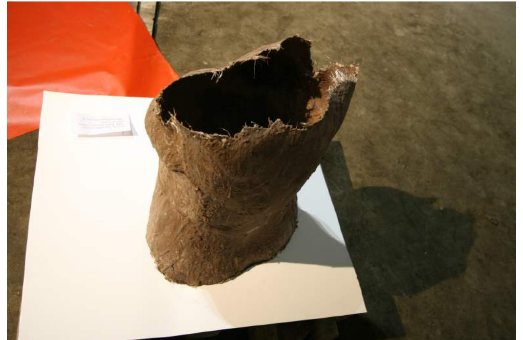
Hedonistic Monument, Tallinn, Estonia, 2008

The goal was to create a hedonistic monument, modeled from my own body shape, a totem enjoyment. Build from various types of chocolate (milk and dark chocolate), .its just standing there.