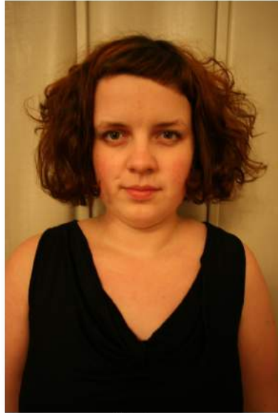
me as artist